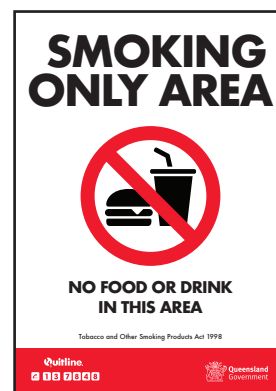
Examples of signs